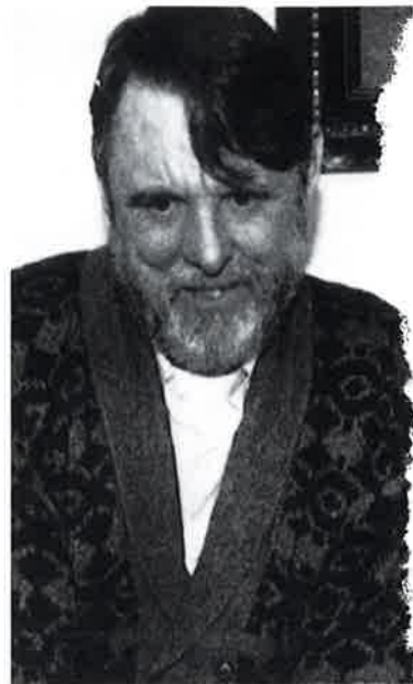
Terry Waite shortly after his release in November 1991.

"I feel like a cross between Humpty Dumpty and Rip Van Winkle - I have fallen off the wall and suddenly awake I find all the pieces of me, before me. There are more parts than I began with. All the Kings horses, and all the Kings men, cannot put Humpty together again..."