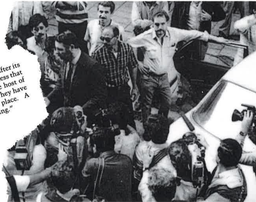
Terry Waite's Lebanon hostage mission in late 1985 was conducted amid a fanfare of publicity. His press conferences in Beirut attracted intense media interest.

Brian Keenan (inset) swapped a dead-end job in Belfast for an exotic lifestyle in Beirut. He lived in this house for six months.