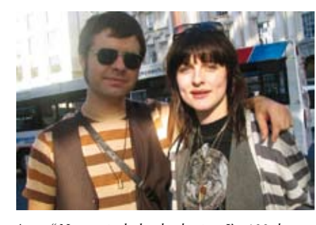
Amy: "Not particularly - by the time I'm 100 the earth won't be inhabitable anyway." Brody: "Don't you get a telegram from the Queen or something? If the Queen delivered a telegram in person it might be enough of an incentive to live to 100."