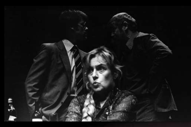
Middle Age Spread by Roger Hall 2003