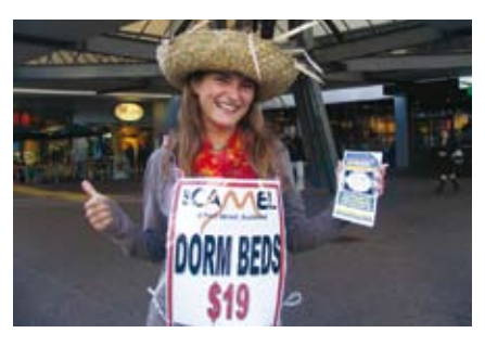
Sam: "No - Why when all my friends are dying and all my kids hate me? I want to have a great life until I am 60 or 70 and then die quickly with a heart-attack."